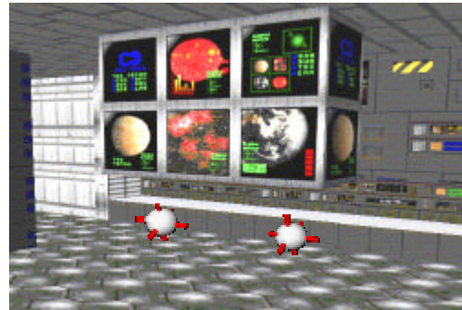
Figure 3 : Two-handed game level walkthrough

Design verification tasks such as visibility, reachability and accessibility, are frequently encountered during evaluation tasks. In our environment, they are built-in and are automatically used throughout the design cycle. If required, relevant viewpoints can be stored and visited as desired.